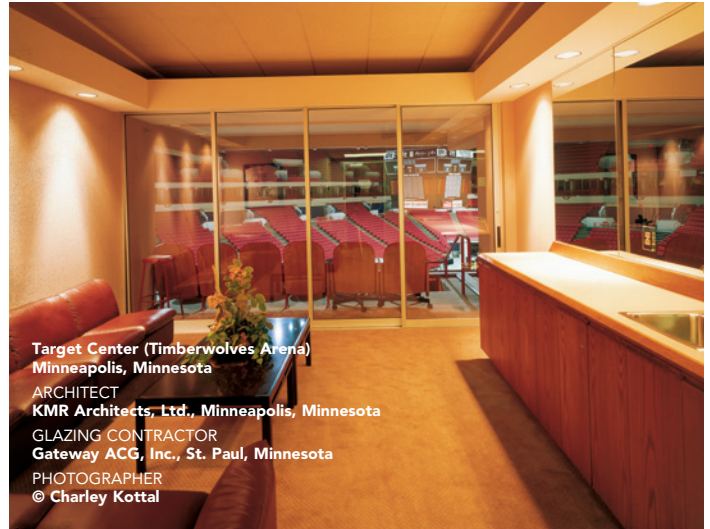
Target Center (Timberwolves Arena) Minneapolis, Minnesota ARCHITECT KMR Architects, Ltd., Minneapolis, Minnesota GLAZING CONTRACTOR Gateway ACG, Inc., St. Paul, Minnesota

Solvent-free powder coatings add the “green” element with high performance, durability and scratch resistance that meet the standards of AAMA 2604.