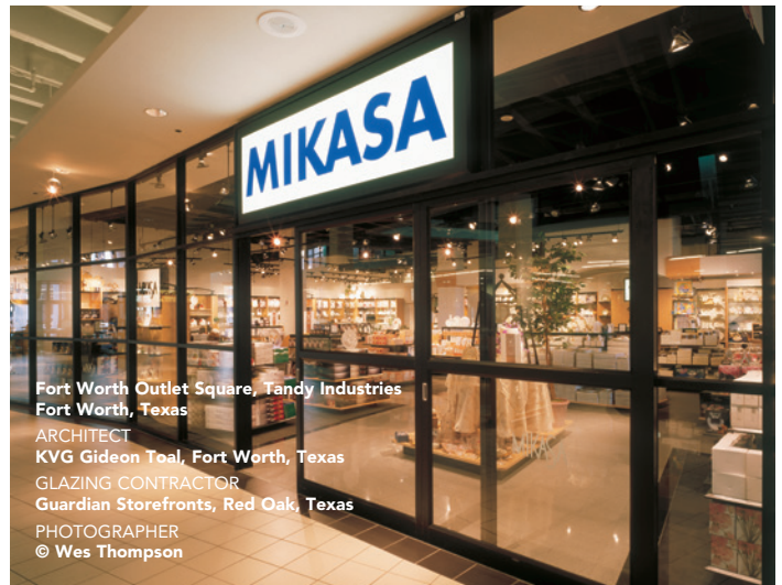
Fort Worth Outlet Square, Tandy Industries Fort Worth, Texas ARCHITECT KVG Gideon Toal, Fort Worth, Texas GLAZING CONTRACTOR Guardian Storefronts, Red Oak, Texas